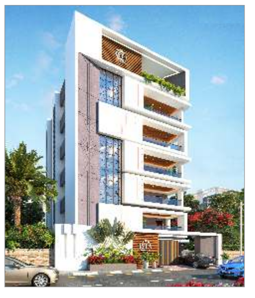
ISTA @ 138 KAKATEEYA HILLS, HYDERABAD