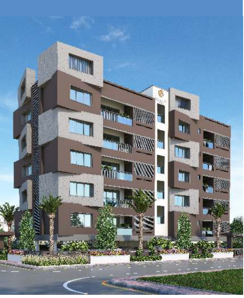
SEASONS BY ISTA HOMES MADHAPUR, HYDERABAD