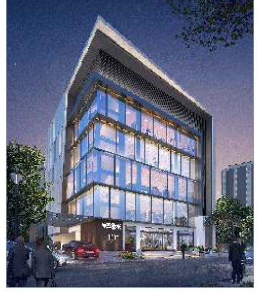
10+ BY ISTA HOMES KAKATEEYA HILLS, HYDERABAD