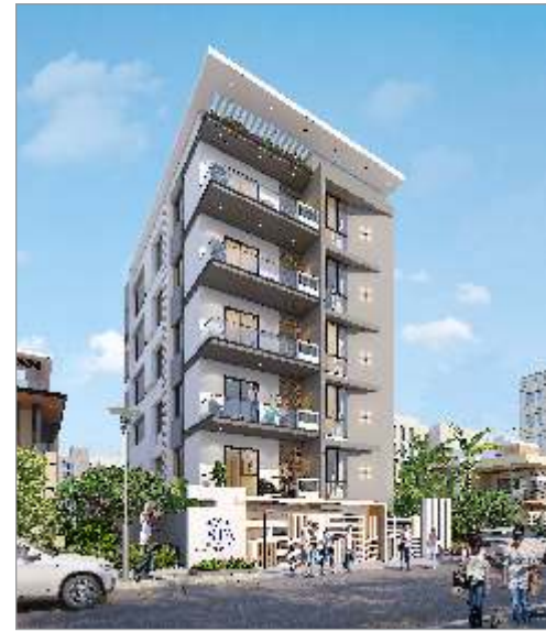
ISTA @ 124 KAKATEEYA HILLS, HYDERABAD