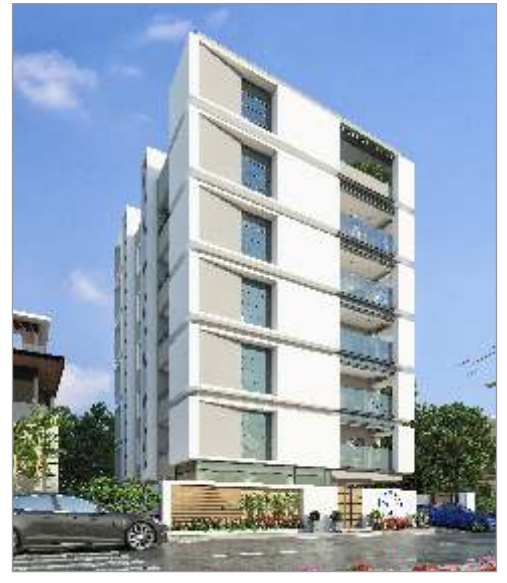
PRINCESS COURT BY ISTA KAKATEEYA HILLS, HYDERABAD