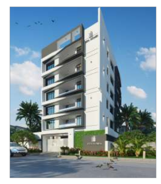
ISTA @ 130 KAKATEEYA HILLS, HYDERABAD