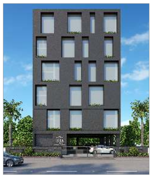
ELEVATE BY ISTA KAKATEEYA HILLS, HYDERABAD