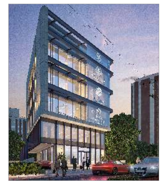
ISTA @ 36 ROAD NO 36, JUBILEE HILLS HYDERABAD