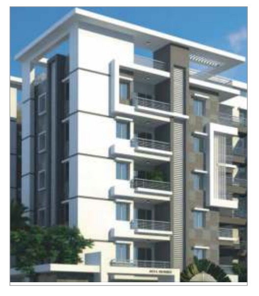
ISTA AVENUE KONDAPUR, HYDERABAD